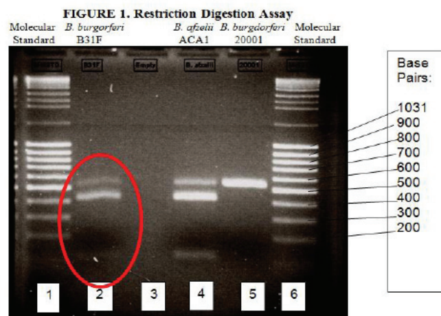
Figure 1. Restriction Digestion Assay. Molecular Standard (gel well 1), Borrelia burgdorferi B31F (gel well 2), Empty (gel well 3), Unknown Borrelia species (gel well 4), Borrelia garinii 20001 (gel well 5), Molecular Standard (gel well 6). The red circle isolates the successful cutting of B31F fur , indicating a mutation exists.

Forty-two strains of Borrelia were analyzed. Twenty-four of these strains were tested via restriction enzyme assay, and eighteen were tested via bioinformatics approach using MacVector version 8.1 (Macintosh). The bioinformatics approach entails analyzing genetic code downloaded from