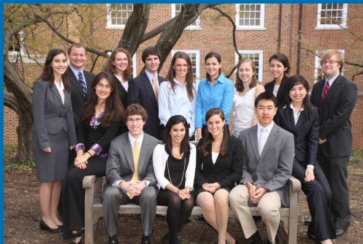
PIP Intern Class of 2011

To donate by phone, or for more information about all giving opportunities, please contact Truin Huntley at 434.924.3551